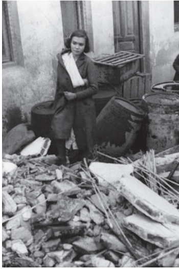
Victims of the Bombing, Tetuán de las Victorias (Madrid), n.d. Silver-gelatin print 29,7 x 23 cm

Capa, Kertész and Brassai from Hungary, David Seymour (Chim) from Poland, the Germans Gerda Taro and Germaine Krull, and the Romanian Eli Lotar.