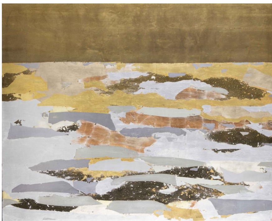
ANNA-EVA BERGMAN N° 31-1965 Finnmark, 1965 Vinyl and metal sheet on canvas 130 x 162 cm FONDATION HARTUNG-BERGMAN

On the right side of the palace, the visitor can delve into works inspired by Norwegian landscapes such as Transparent Mountain (1967) or Big Red Finnmark (1967), that shows the icy views of glaciers and fjords in Finnmark, the northeast region of the country.