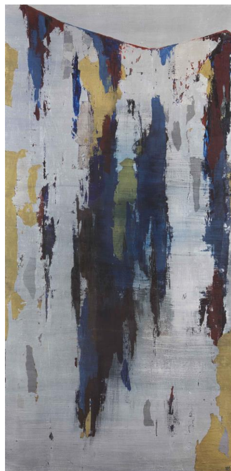
ANNA-EVA BERGMAN N° 36-1965 Falaise [Cliff], 1965 Oil and metal sheet on canvas 195 x 97 cm FONDATION HARTUNG-BERGMAN

After an artistic hiatus, she resumed painting vigorously in 1946, and in late 1948 she embraced a non-figurative approach. She invented and constructed a unique universe around line and rhythm. Definitively established in Paris in 1953, her work consolidates the exploration of lines and color surfaces, opposing to the informalist tendencies in vogue. In 1958, Anna-Eva Bergman assembled, for the first time in her painting, a repertory of the forms she had been developing in her work since 1952: rock, moon, star, planet, mountain, stele, tree, tomb, valley, boat, prow, and mirror.