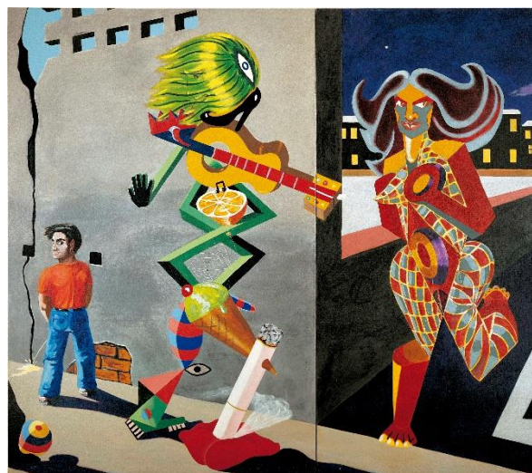
MANOLO QUEJIDO Without Words [ Sin palabras ], 1977 Acrylic on canvas Dyptic: 270 x 300 cm Museo de Arte Contemporáneo de Madrid © Manolo Quejido, VEGAP, Madrid, 2022

Three slightly earlier works are shown in the Palacio's right towered space: Ele [Bravo, 1978], Subevida [Here Your Drink, 1977] or Sin palabras [Without Words, 1977]. The latter meant Quejido's dive into large-format canvas painting, and it speaks of an inadequacy between the world, things, and images. Sin palabras is a diptych where Quejido, playing with space, depicts night and day as walking figures who are about to bump into each other. If the moment of transit between day and night (or night and day) can be ascribed to both day or night, at the same time it is an instant which is distinct from the two, a unique instant for which in the Spanish language does not avail of one only word (the Spanish language does, indeed, have separate terms for the moment of twilight and the moment of dawn). Sin palabra is therefore a work displaying the difficulties of language to name things or events. Similarly, the incompatible nature of words and things is made evident in Matilde disimula un pensamiento [Matilde Dissimulates a Thought, 1974]. A painting that would open Quejido's lifelong concern on the relation between painting and thought.