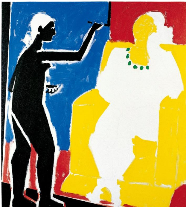
MANOLO QUEJIDO Painting [La pintura], 2002 Acrylic on canvas 200 x 180 cm Private Collection © Manolo Quejido, VEGAP, Madrid, 2022