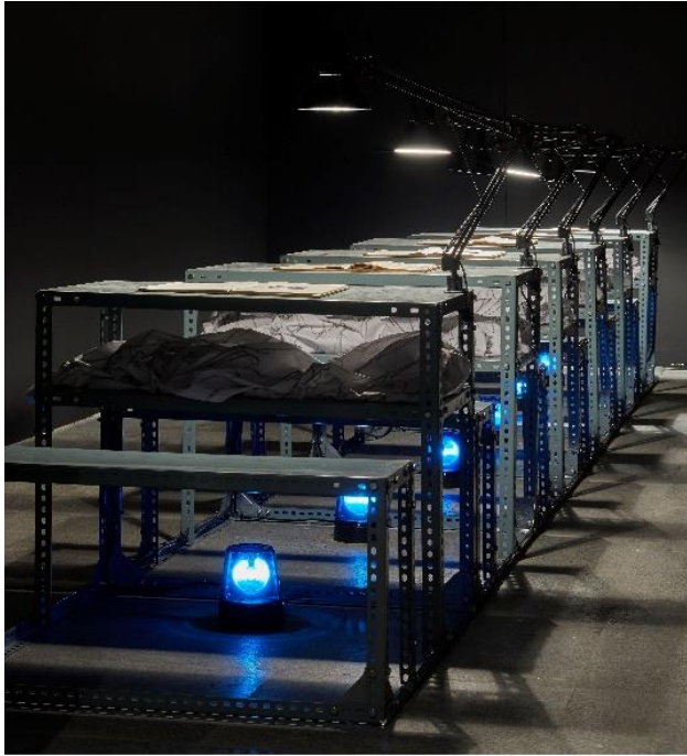
CONCHA JEREZ, Que nos roban la memoria . Julio, 2020 Vista de sala (Planta 3 del Edificio Sabatini) Museo Nacional Centro de Arte Reina Sofía

The main section extends to the areas adjoining the exhibition halls and presents a partial survey of Concha Jerez's career. In this section, conceptualist projects on paper (drawings, collages, prints and artists' books) - many of them not displayed since the seventies, when they were made - refer to the last days of the Franco's regime in Spain and the violent protests reported in the press at the time, while more recent installations critically and poetically examine current affairs, such as Table of Mobile Conflicts (1994).