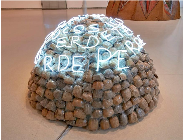
Mario Merz. Iglú de Giap . 1968 Hierro, bolsas de plástico, barro y neón. 120 cm altura x 200 cm diámetro. Musée national d'art moderne/Centre de création industrielle Centre Pompidou © Mario Merz by SIAE, VEGAP, Madrid, 2019

workers' struggle, Merz expressed his visceral rejection of the consumerist world, which he considered the main instrument of domination and alienation in advanced capitalist societies.