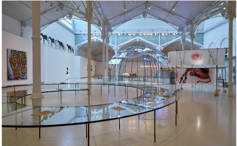
Vista de sala de la exposición Mario Merz. El tiempo es mudo . Palacio de Velázquez. Octubre, 2019. Museo Nacional Centro de Arte Reina Sofía.

Another key element in Merz's work is the table, which interested him because of its polysemy: a table is an everyday object and also an altar, a space for working and for intimacy, a place for meeting and celebration. A simple board to which legs are added sums up Merz's "povera" methodology, in which the humblest materials in our ordinary surroundings become art and are endowed with aesthetic