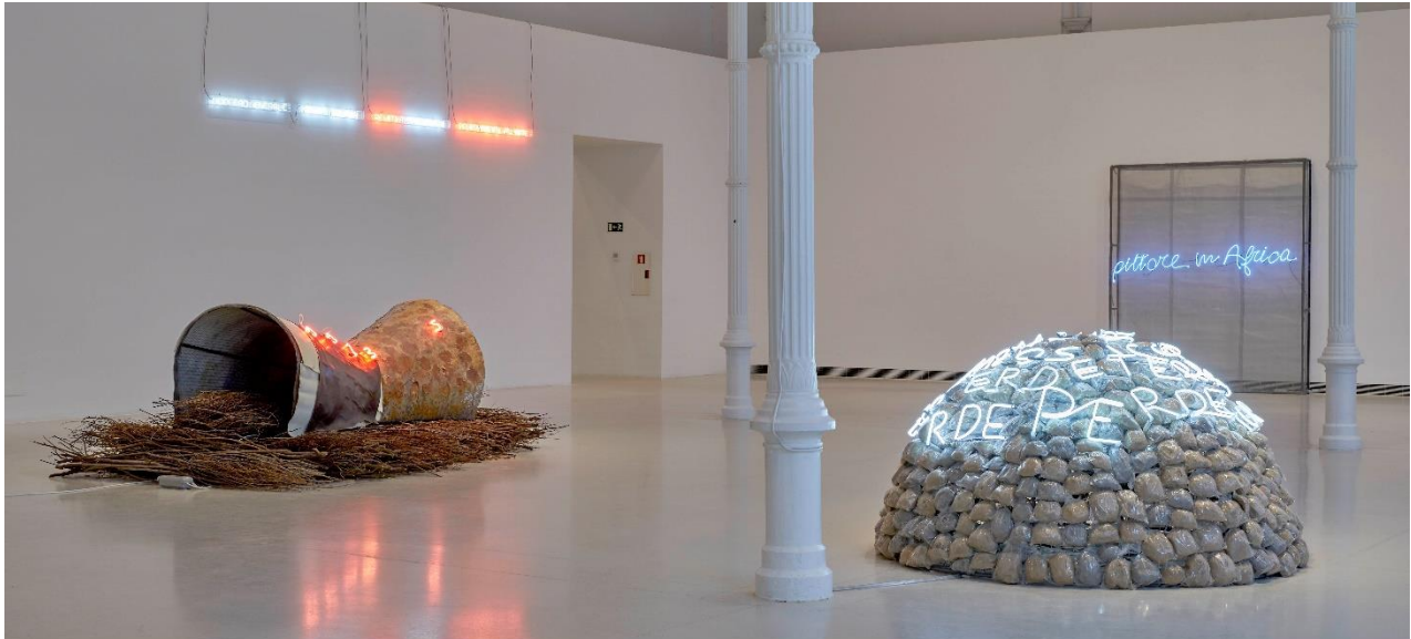
Vista de sala de la exposición Mario Merz. El tiempo es mudo . Palacio de Velázquez. Octubre, 2019. Museo Nacional Centro de Arte Reina Sofía.